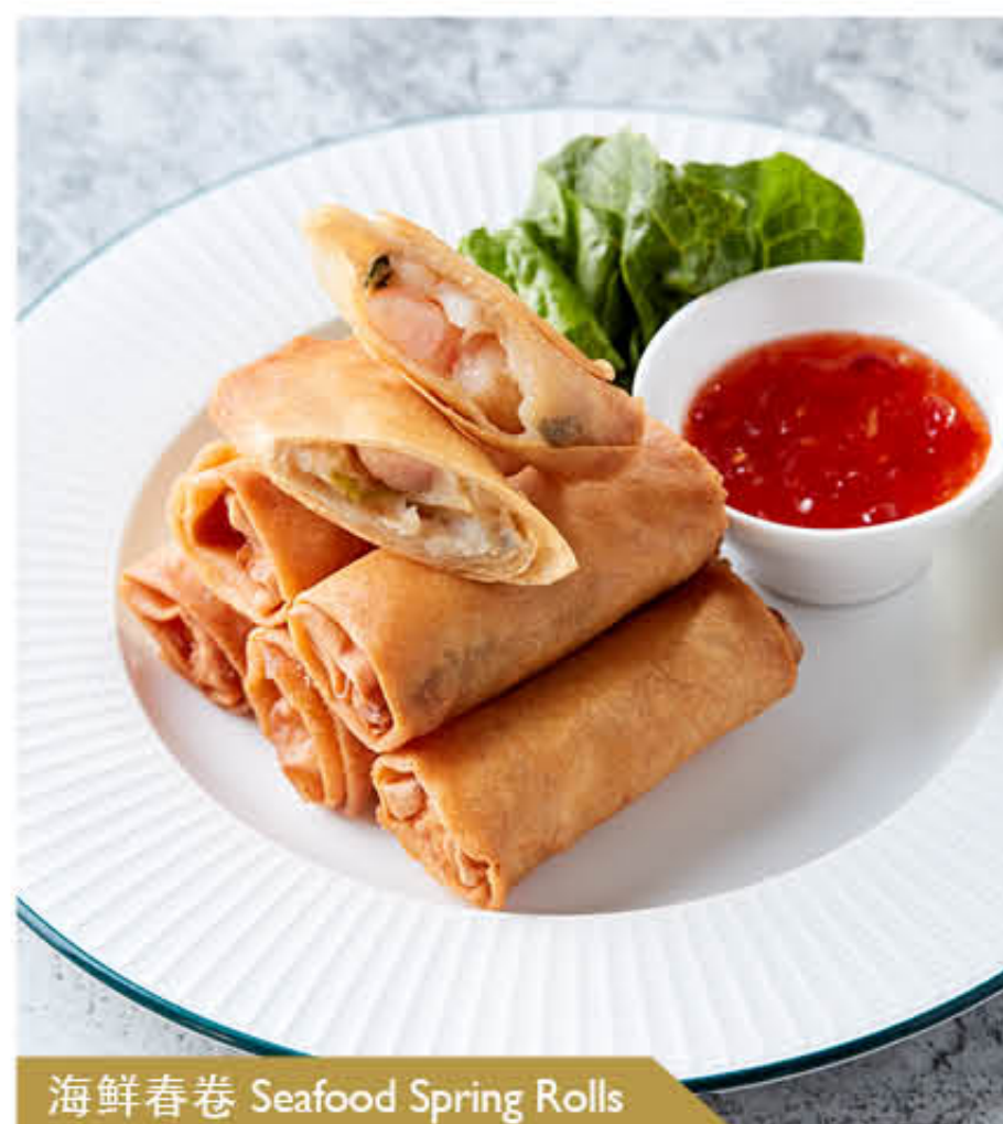
海鲜春卷 Seafood Spring Rolls

澳门元 58 例/Regular MOP 澳门元 108 大/Family MOP