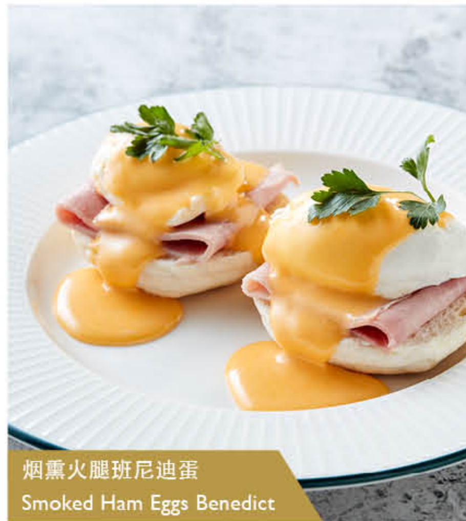
烟熏火腿班尼迪蛋 Smoked Ham Eggs Benedict