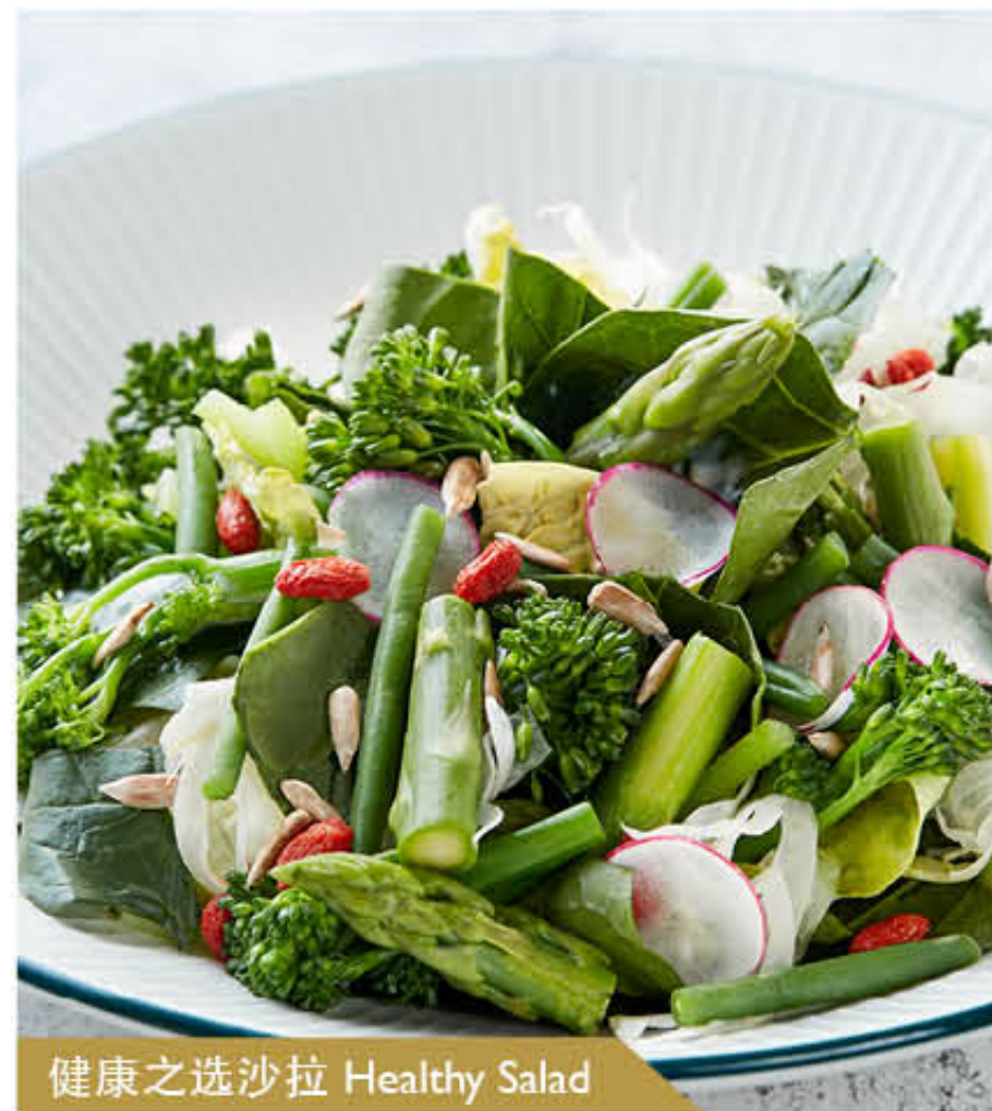
健康之选沙拉 Healthy Salad