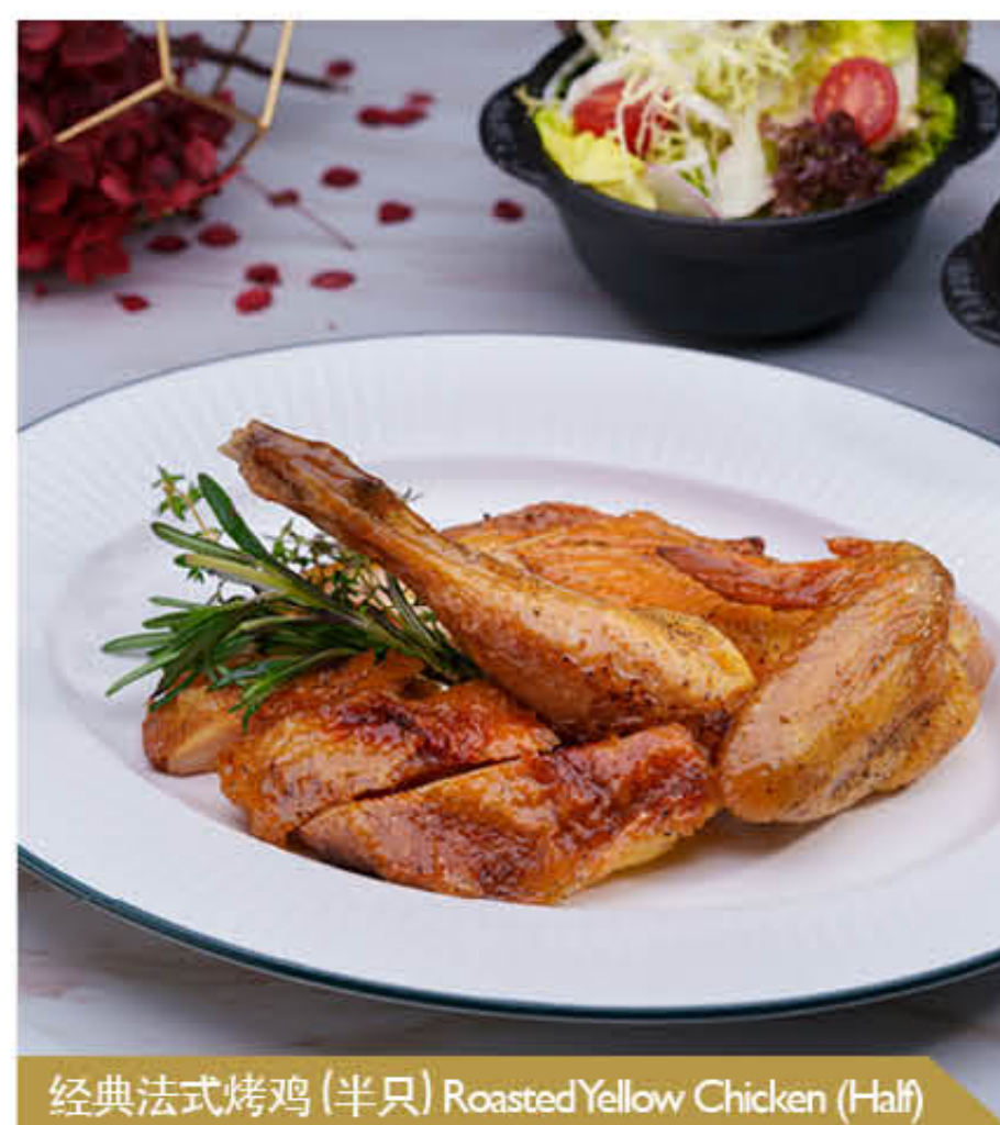
经典法式烤鸡 (半只) Roasted Yellow Chicken (Half)