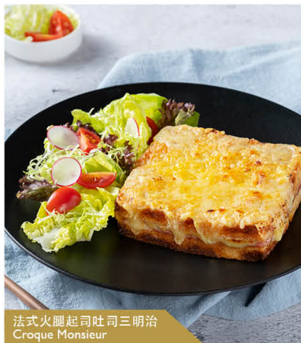
法式火腿起司吐司三明治 Croque Monsieur