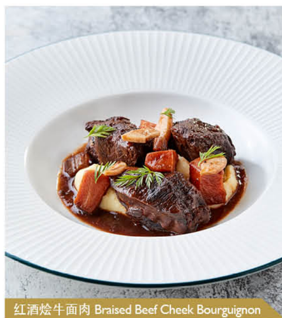
红酒烩牛面肉 Braised Beef Cheek Bourguignon