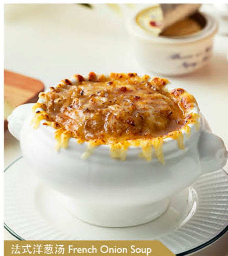
法式洋葱汤 French Onion Soup