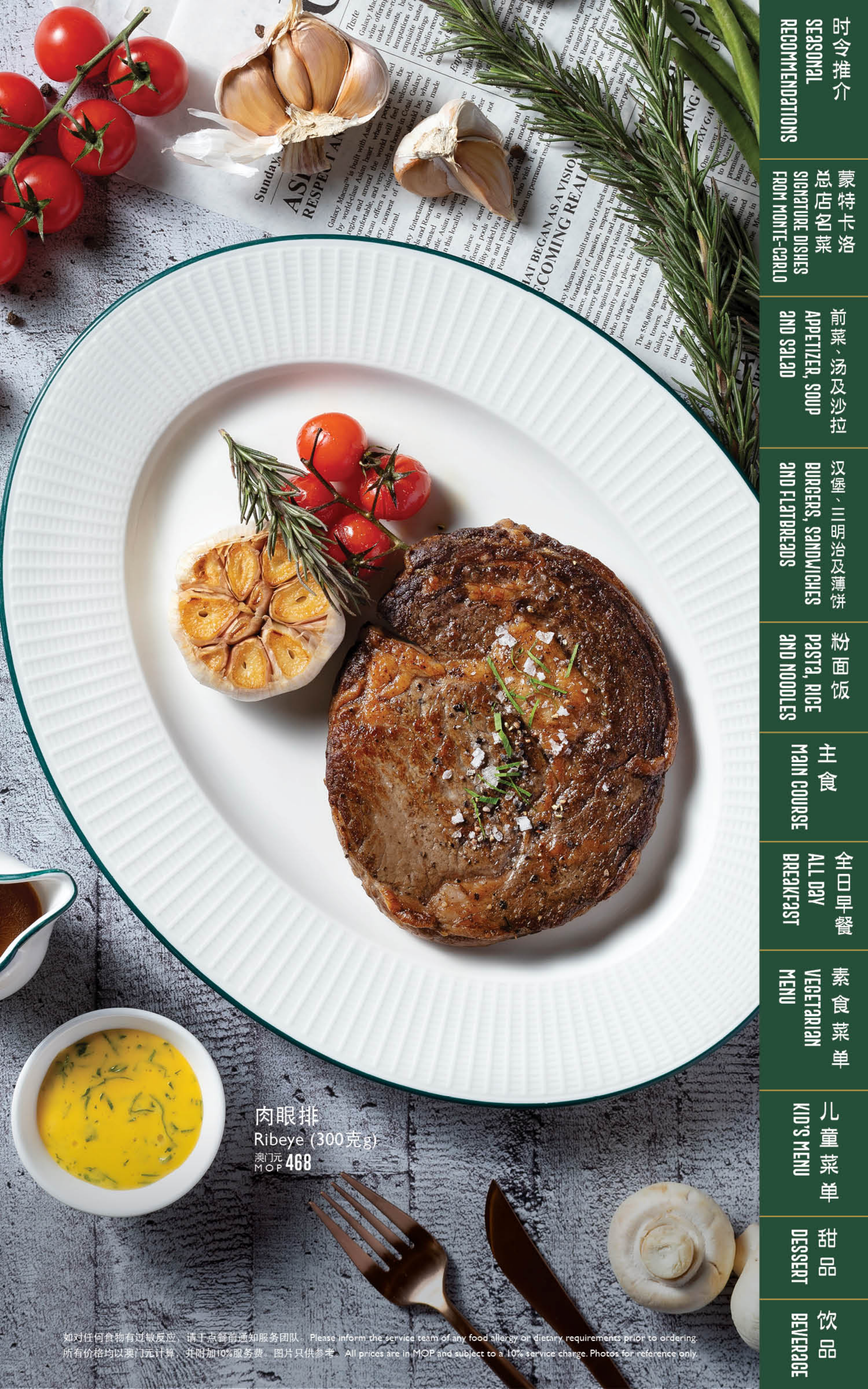
肉眼排 Ribeye (300克g) 澳门元 468 MOP 468