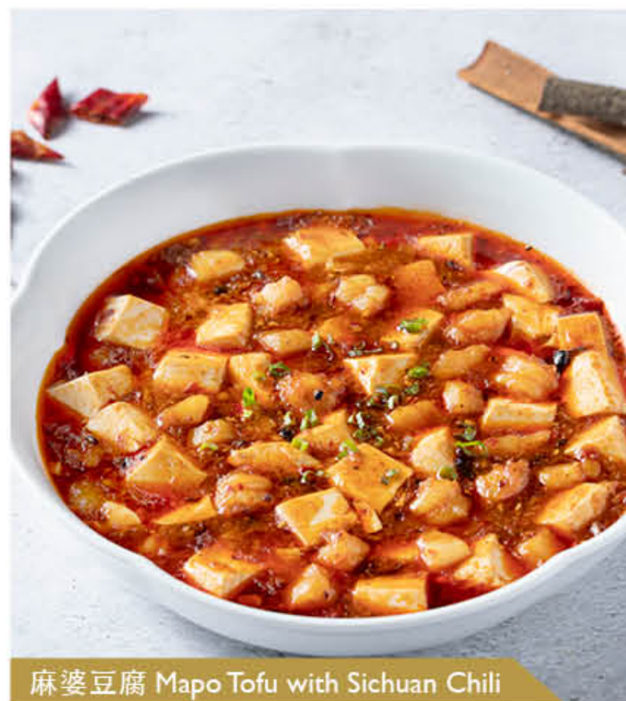
麻婆豆腐 Mapo Tofu with Sichuan Chili