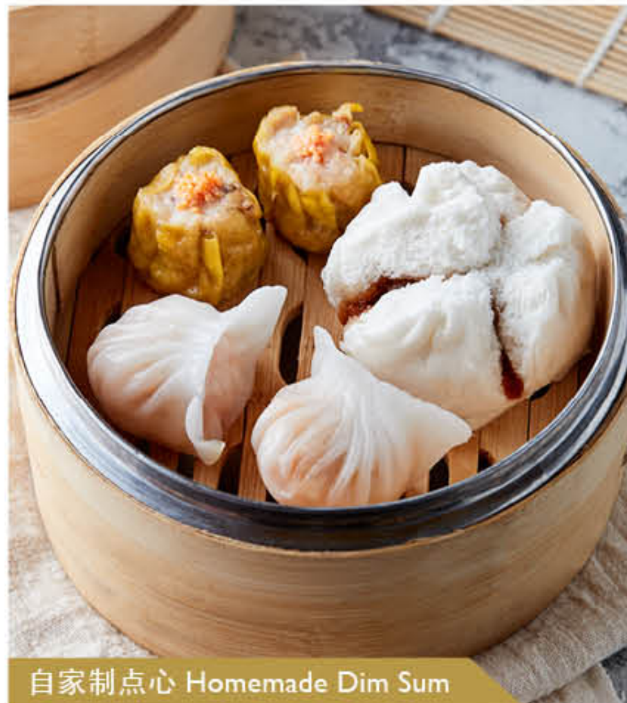
自家制点心 Homemade Dim Sum