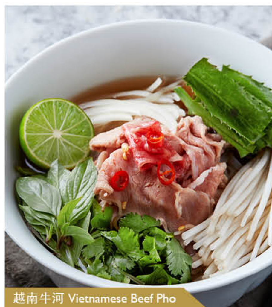
越南牛河 Vietnamese Beef Pho