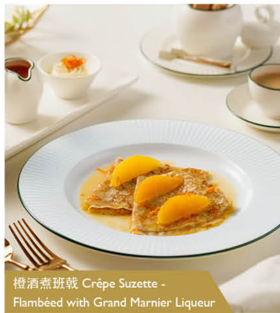
橙酒煮班戟 Crêpe Suzette - Flambéed with Grand Marnier Liqueur