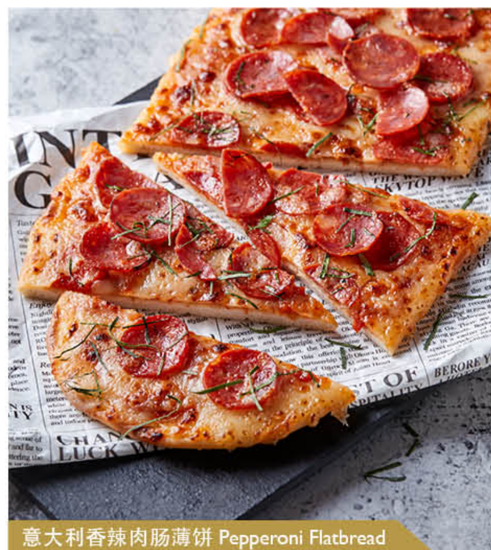
意大利香辣肉肠薄饼 Pepperoni Flatbread