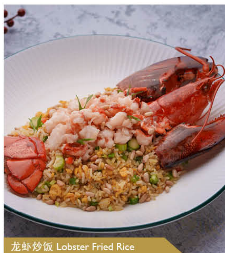
龙虾炒饭 Lobster Fried Rice