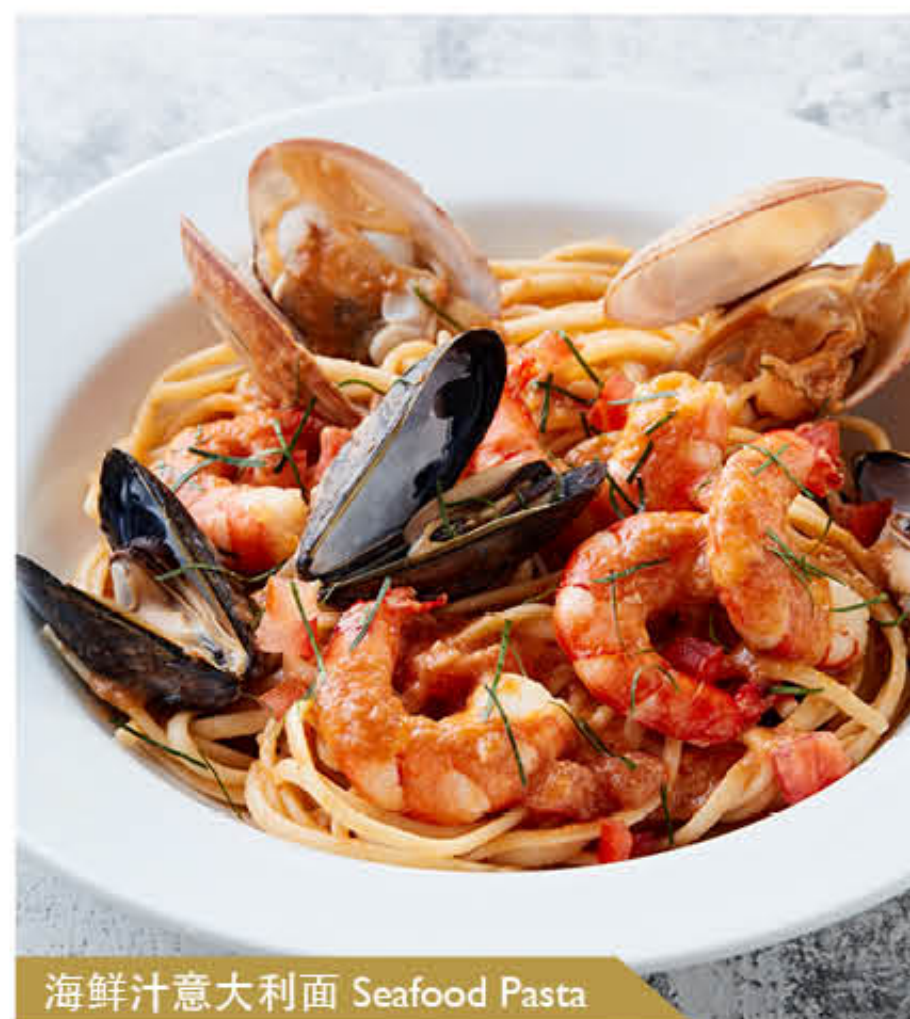
海鲜汁意大利面 Seafood Pasta