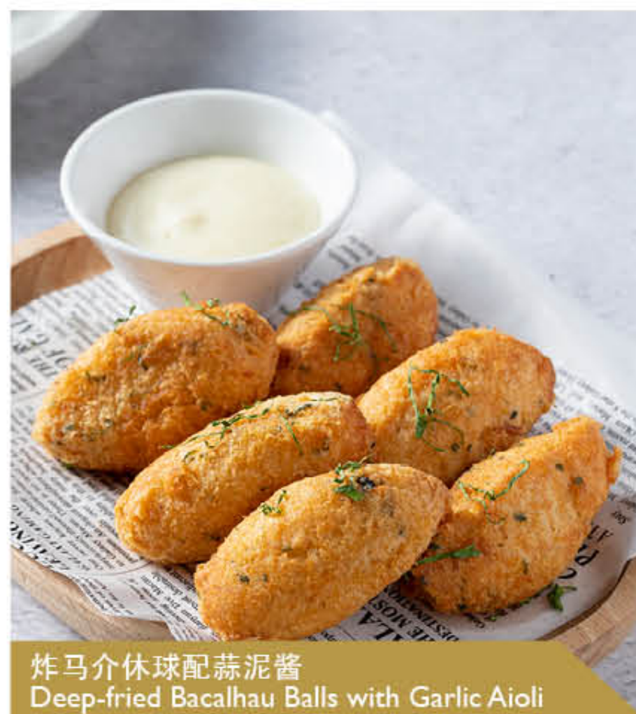
炸马介休球配蒜泥酱 Deep-fried Bacalhau Balls with Garlic Aioli