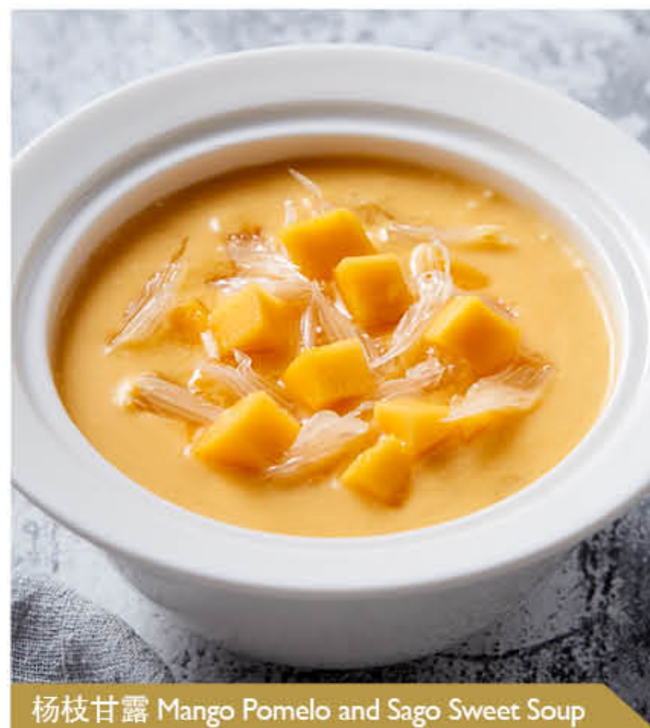
杨枝甘露 Mango Pomelo and Sago Sweet Soup