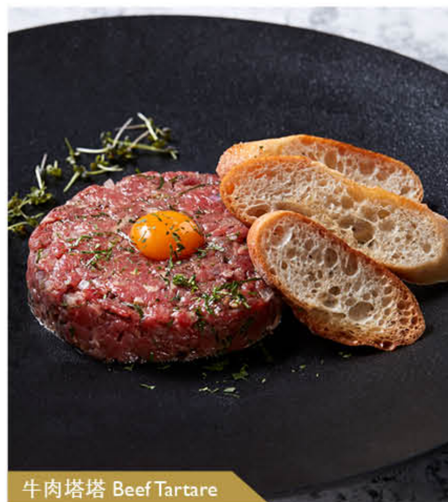
牛肉塔塔 Beef Tartare

始创于1895年摩纳哥蒙特卡洛总店 Created at the Café de Paris Monaco in 1895