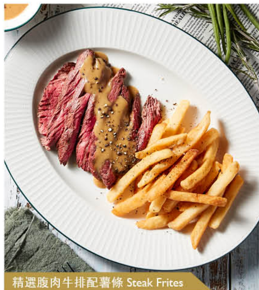
精選腹肉牛排配薯條 Steak Frites