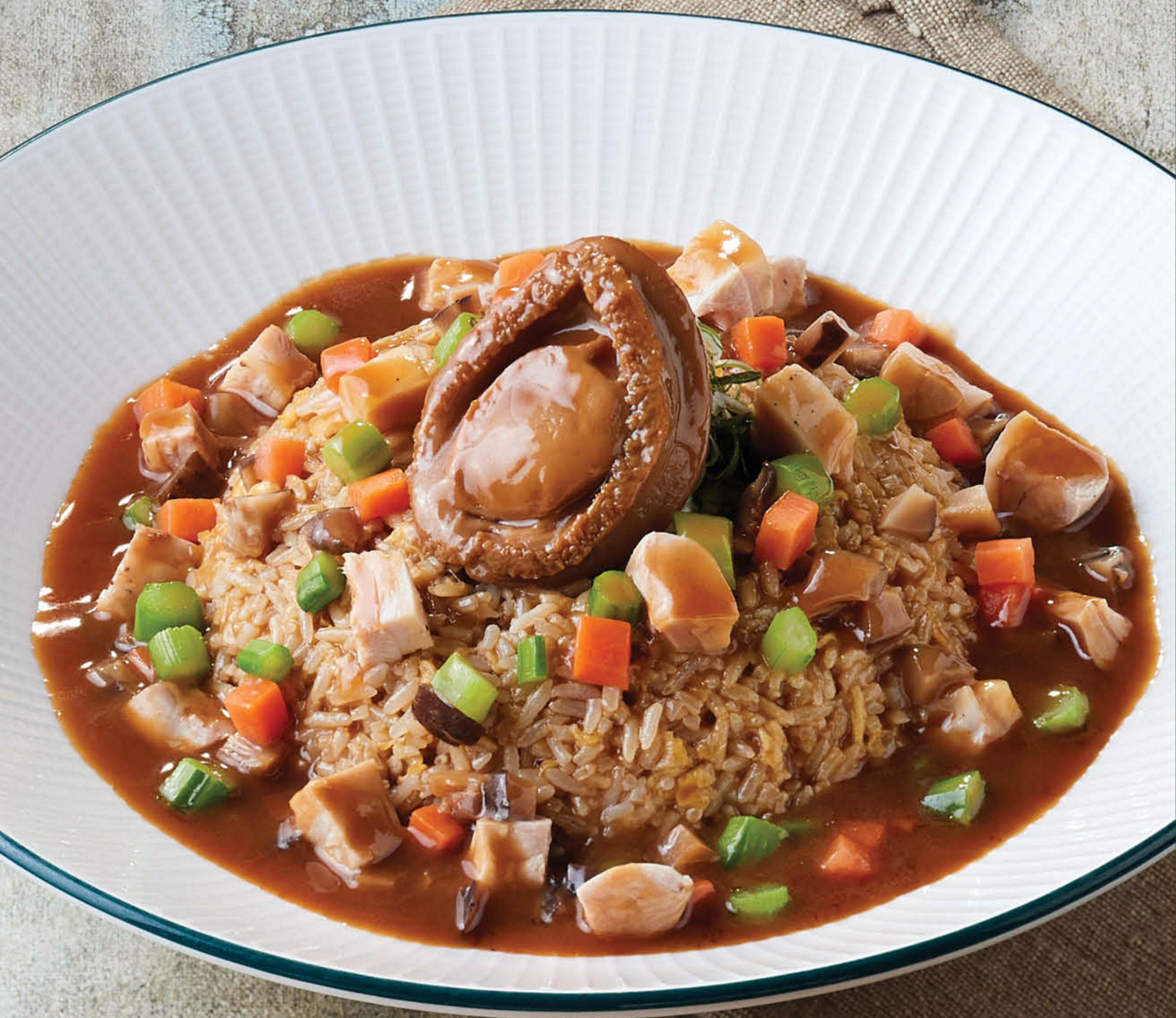
鲍鱼鸡粒烩饭 Abalone and Chicken Rice with Gravy 澳门元 198 MOP