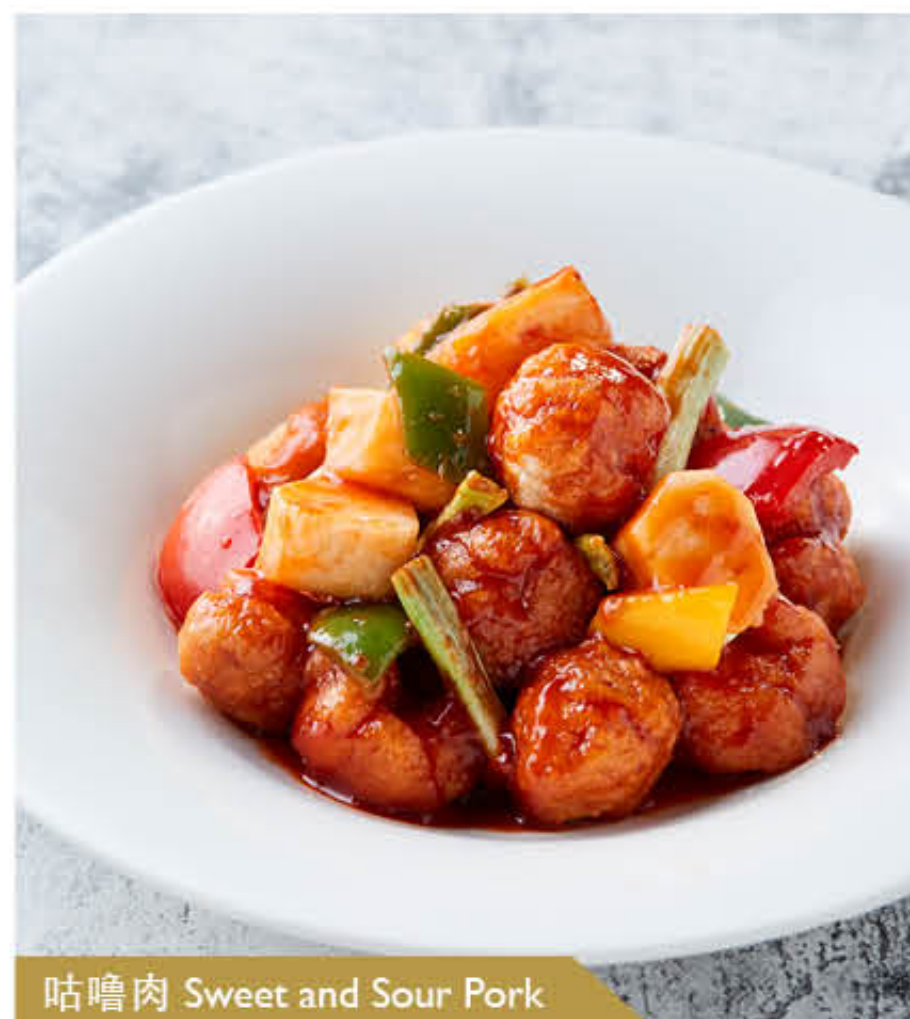
咕嚕肉 Sweet and Sour Pork